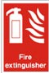
Fire extinguisher FEX.01F-200x300 FEX.01W-150x200 FEX.01E-150x200

Are your fire procedures understood? Is all your firefighting equipment clearly marked?