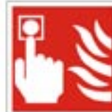
Fire alarm call point